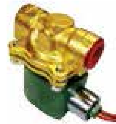
AIR SOLENOID VALVE