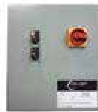
UL & ETL LISTED CONTROL PANEL

Spray booths manufactured by BlastOne meet and/or exceed all applicable OSHA and NFPA regulations.