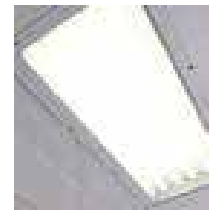
INDUSTRY-LEADING LIGHT LEVELS