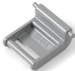
Battery Door Hinge (retainer) Part # 03-818