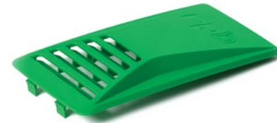
Door Cover Part # 03-812