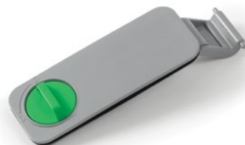
Battery Door Assembly (includes 03-818) Part # 03-815