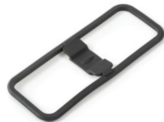
Battery Door Seal Part # 03-817