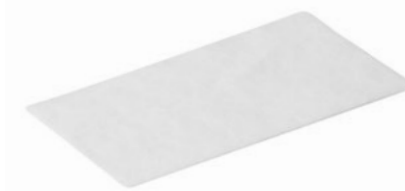
Pre-filter (pk 10) Part # 03-890