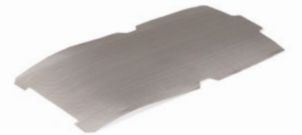
Spark Arrestor Part # 03-891