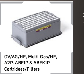
OV/AG/HE, Multi-Gas/HE, A2P, ABE1P & ABEK1P Cartridges/Filters

HEPA cartridge/filter - removes up to 99.97% of particulates down to 0.12 microns. Gas cartridges/filters protects against organic vapor exposure. Replace the pre-filter daily to extend the life of the main cartridge/filter.