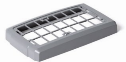
HEPA Cartridge/Filter Door Part # 03-813