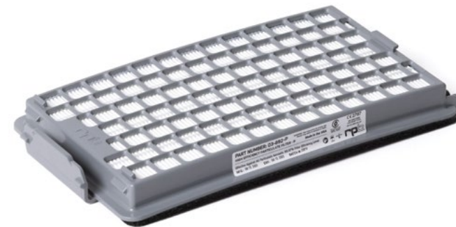
HEPA Cartridge/Filter Part # 03-892